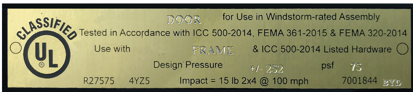
Figure 2: Example UL tornado safe room door label

Important information regarding performance of these assemblies is the tested design pressure and the tested missile impact speeds.